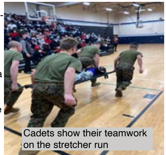
Cadets show their teamwork on the stretcher run