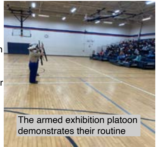
The armed exhibition platoon demonstrates their routine

The MCHS military drill team will be competing in a meet next month at Portage, followed by the sectional championship at Purdue University in West Lafayette in March. The winner of the Purdue meet qualifies for the National MCJROTC championship in Orlando, FL in April. The cost of that trip, like all MCJROTC activities, is covered by the Marine Corps. The cadets will also be supporting the boys basketball home games as well as the boys basketball regional tournament on March 12th.