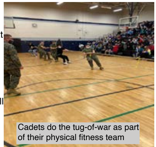
Cadets do the tug-of-war as part of their physical fitness team